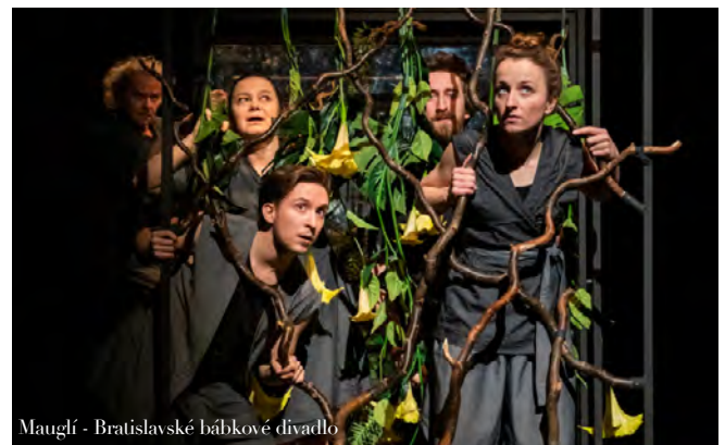
Maugli - Bratislavské bábkové divadlo

In September, the Bratislava Puppet Theatre was awarded four prizes at the 54th PIF International Puppet Festival in Zagreb (Croatia) for the performance Chrono Pixies . At the same time, this young and promising group of theatre artists was awarded the GRAND PRIX at the theatre festival in Banja Luka (Bosnia and Herzegovina) in October for the performance of Maugli .